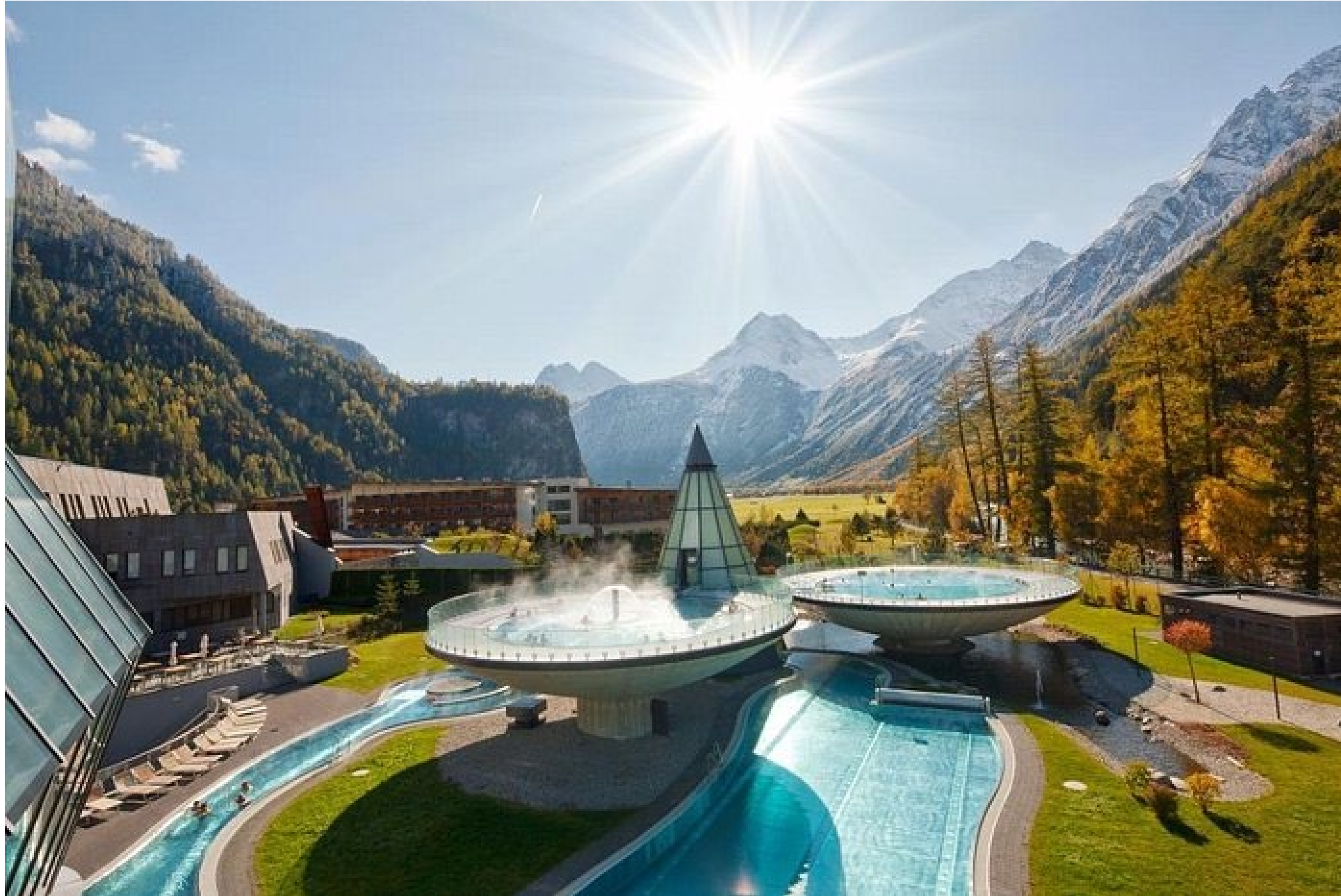
aquua dome, Austria